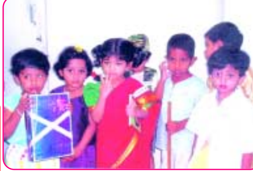
OUR NURSERY CHILDREN IN FANCY DRESS AT NCS - NG