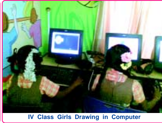
IV Class Girls Drawing in Computer