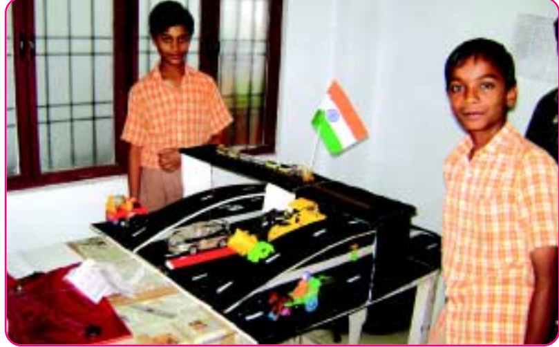
MY FLAG FLIES OVER THE FLY OVER SOON WE MAKE INDIA EMERGE TO FLY OVER THE OTHER COUNTRIES - NCS - UHS