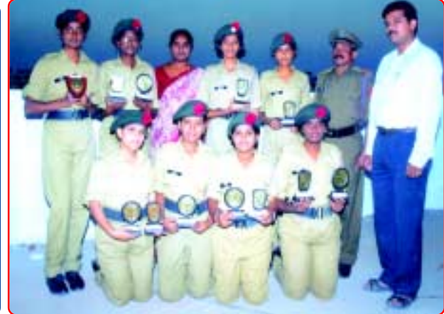
Uppal (Resi) Class IX Class girls won the trophy in Throw Ball Competition at Bison grounds conducted by 24 ATC Camp