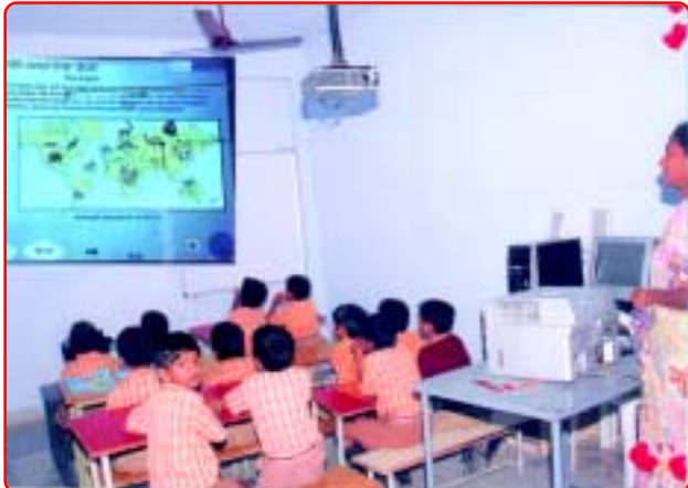
Effective learning through Audio Visual Teaching NCS - Uppal Primary