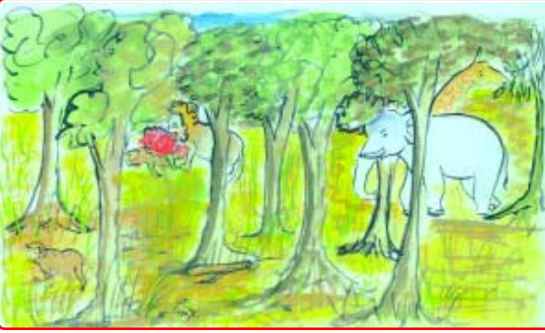
- By Manvitha, VII Class, NCS - KP