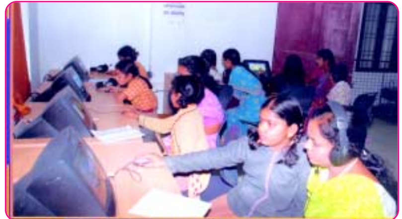
MOTHER CHILD PROGRAMME AT NCS - UHS