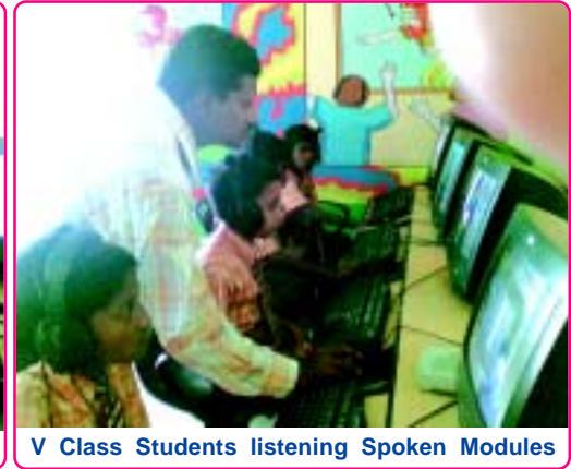
V Class Students listening Spoken Modules