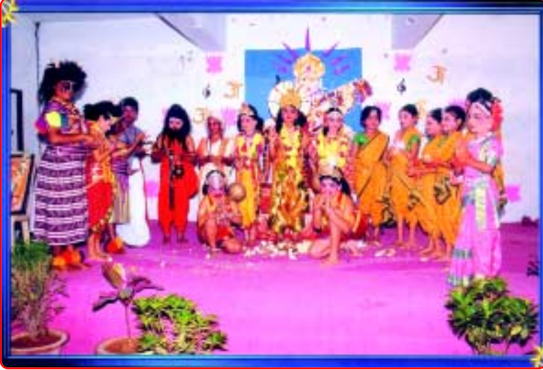
Sri Panchami, Birthday of Goddess Saraswathi was celebrated with the mythological fervour with students playing Bala Ramayana at Tarnaka