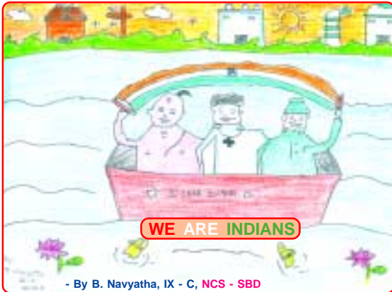
- By B. Navyatha, IX - C, NCS - SBD