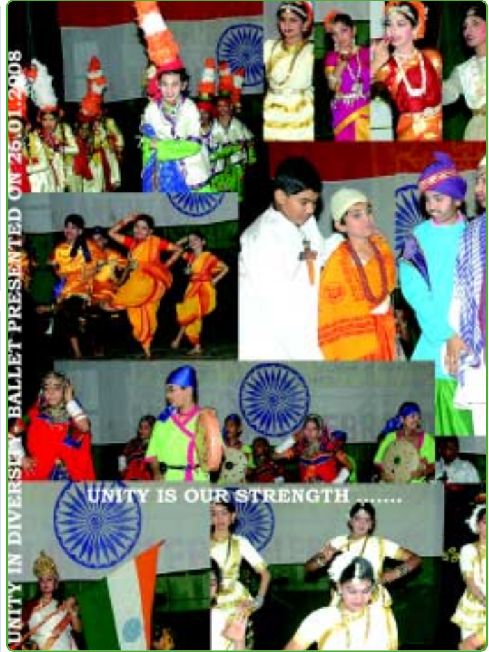
Annual Day Celebrations at NCS - SR Nagar